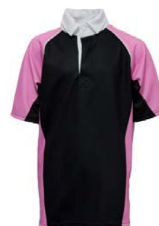
(Shield house games shirt pictured)