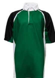
(Eagle house games shirt pictured)