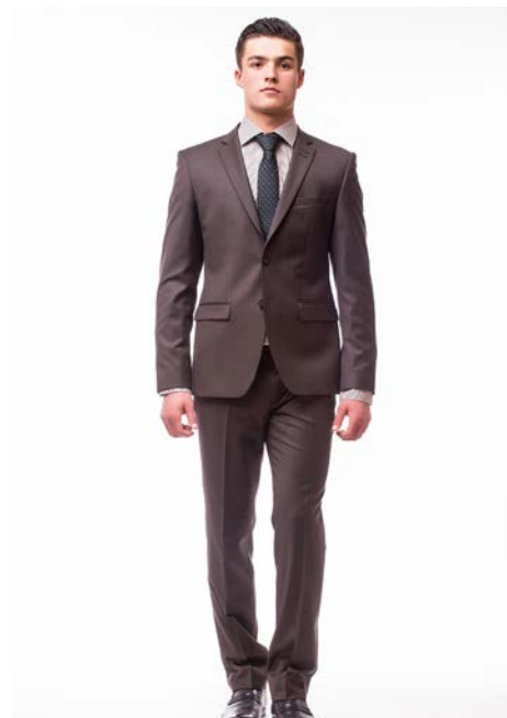
Plain suit Sensible colour

Shirt with a stiff collar and sensible tie