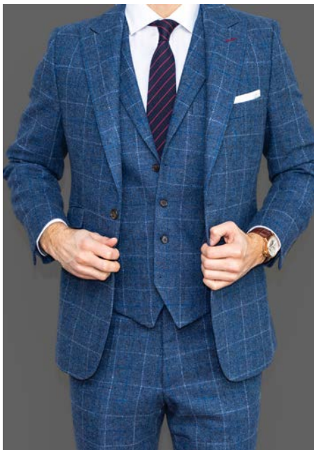
Patterned suit Waistcoat matches suit

Shirt with a stiff collar and sensible tie