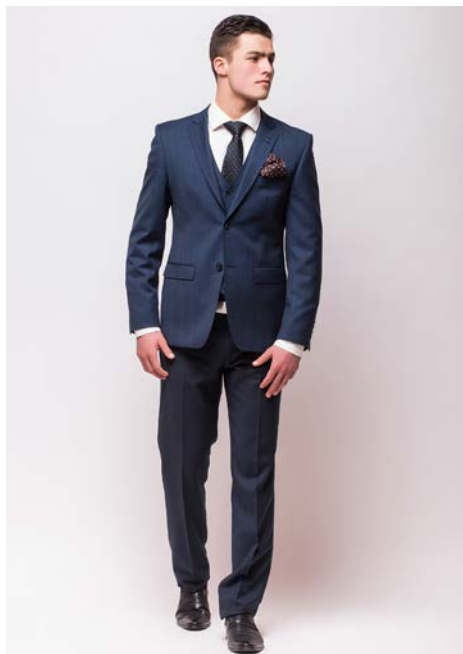
Plain suit Sensible colour

The following images are examples of suits/outfits that may be acceptable.