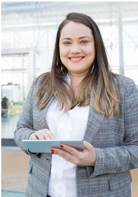
Patterned suit Sensible colour

(Shirt not acceptable - it should have a collar)