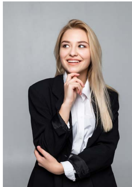
Plain suit Sensible colour

The following images are examples of suits/outfits that would not be acceptable.