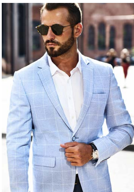
Jacket too bright Top and bottom not matching No tie

The following images are examples of suits/outfits that would not be acceptable.