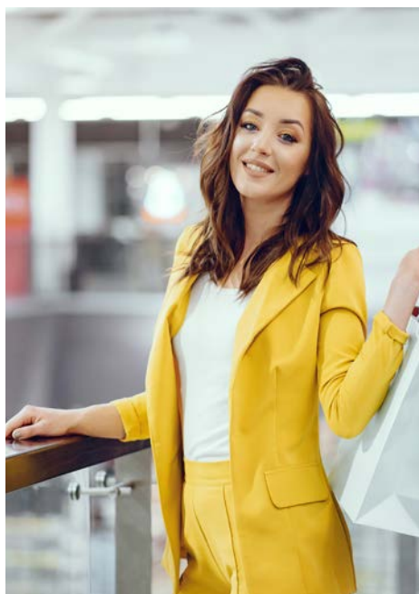
Bright colour No shirt with collar

The following images are examples of suits/outfits that would not be acceptable.