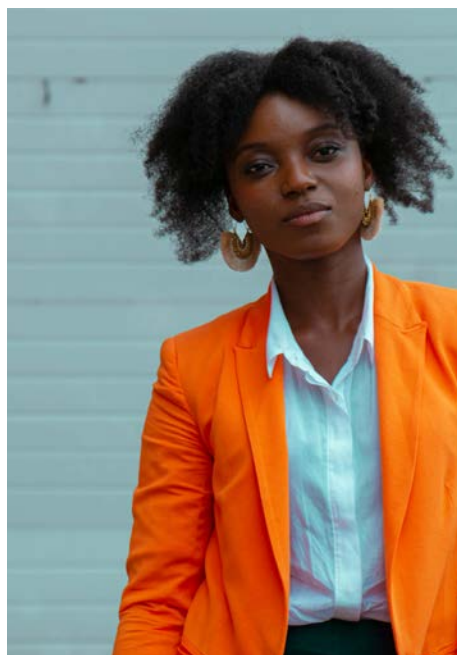
Bright colour Top and bottom not matching