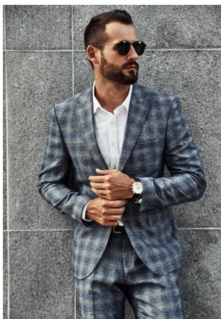
Suit too patterned No tie