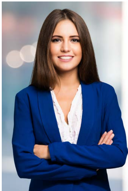
Plain suit Sensible colour

The following images are examples of suits/outfits that may be acceptable.