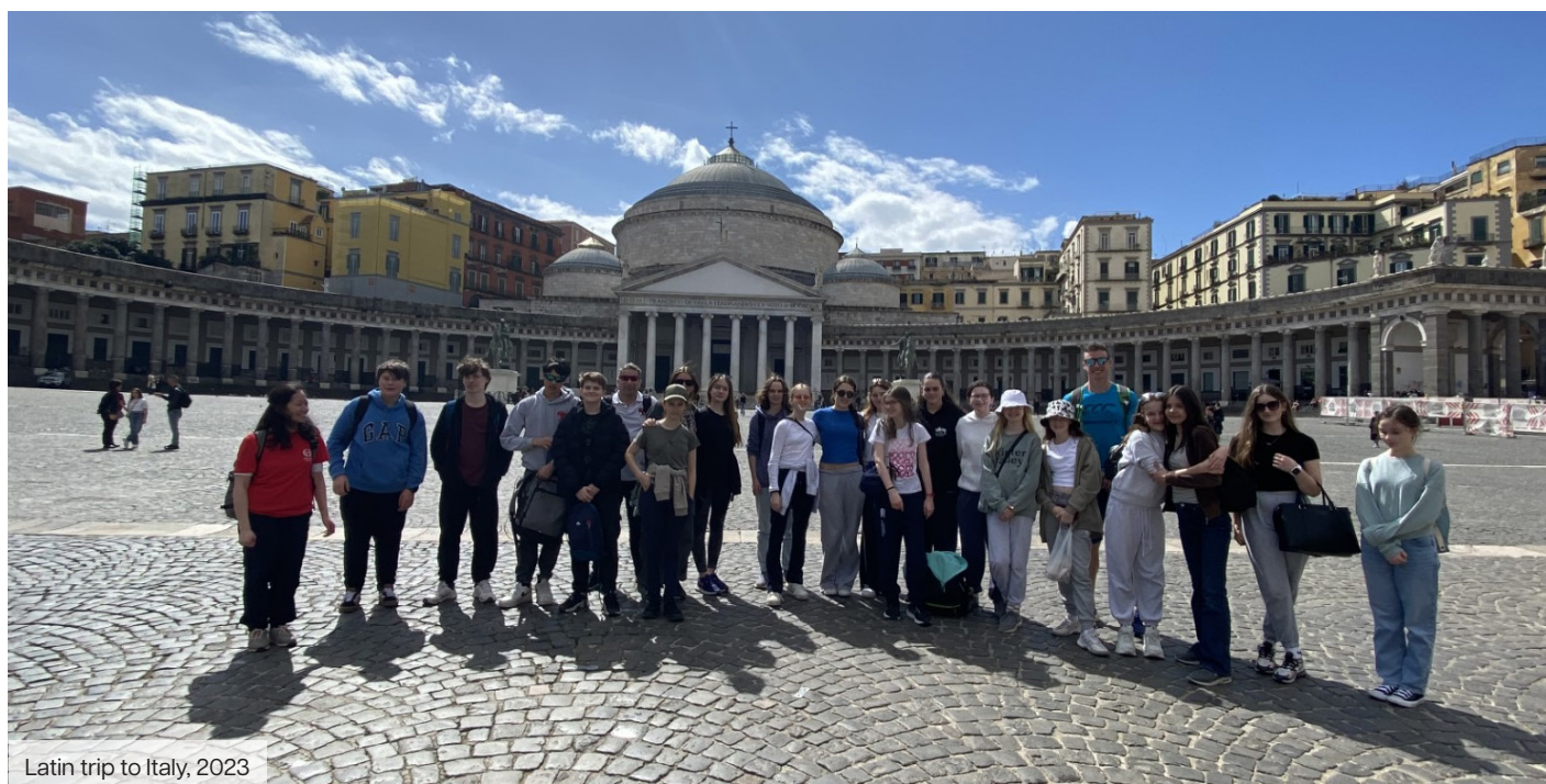
Latin trip to Italy, 2023

Most of the translation is from Latin to English, but there are opportunities for pupils to practise writing in Latin if they would like to. We teach pupils to pronounce the Latin during lessons for fun, but there are no speaking or listening assessments. The balance between language and culture allows for an engaging, challenging and rewarding course.