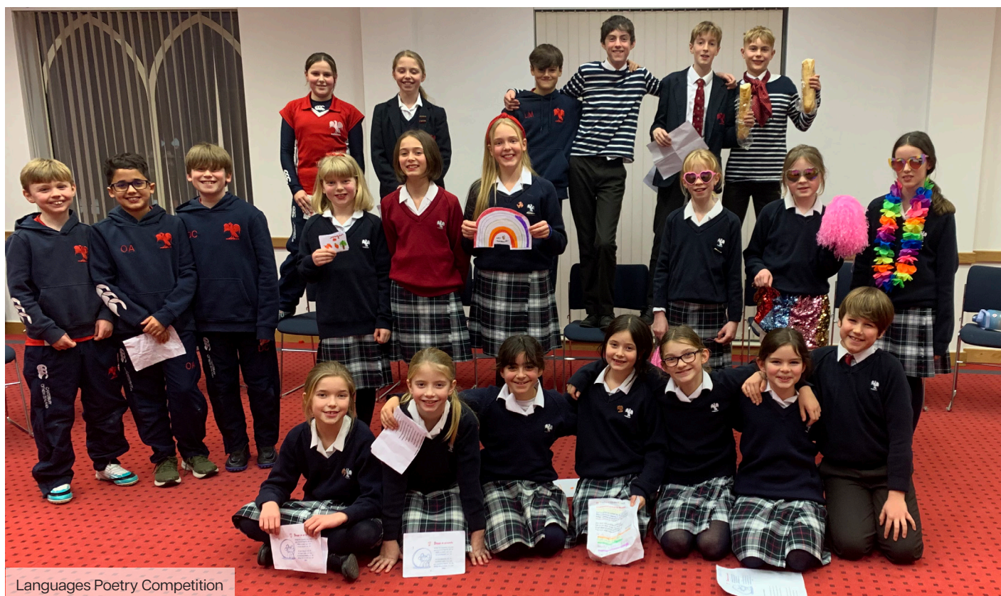
Languages Poetry Competition

The academic curriculum is supported with a range of co-curricular activities such as cooking trips, visiting theatre companies performing in the target language and cinema visits to the BRI or Institut Français. Pupils in Years 7 and 8 also have the opportunity to take part in a national Spelling Bee.